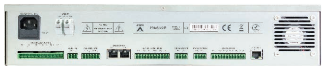
Rear View of PRIMA-VA/680R